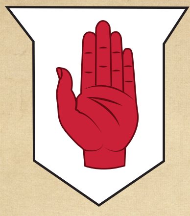
36th (Ulster Division)

The Officers of The Somme Association wish to record their sincere appreciation to all who have assisted with, and participated in, these Commemorations, particularly the Officers and other Ranks of The 1st and 2nd Battalions of The Royal Irish Regiment; the Band, Bugles, Pipes and Drums of The Royal Irish Regiment; 38th (Irish) Brigade and the Band of 2 Brigade Defence Forces Ireland.