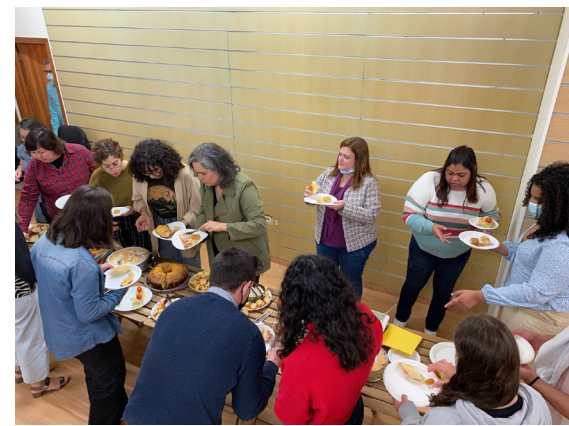
Supper on Good Friday