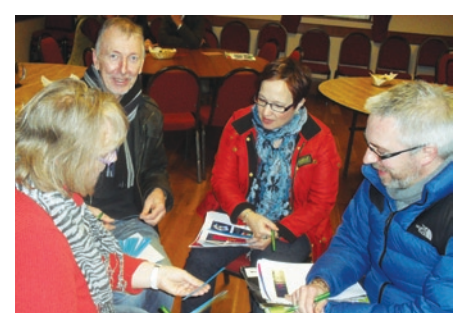
Designated Person Training, Richhill