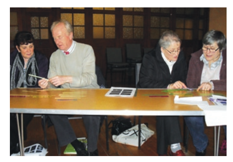
Designated Person Training, Letterkenny