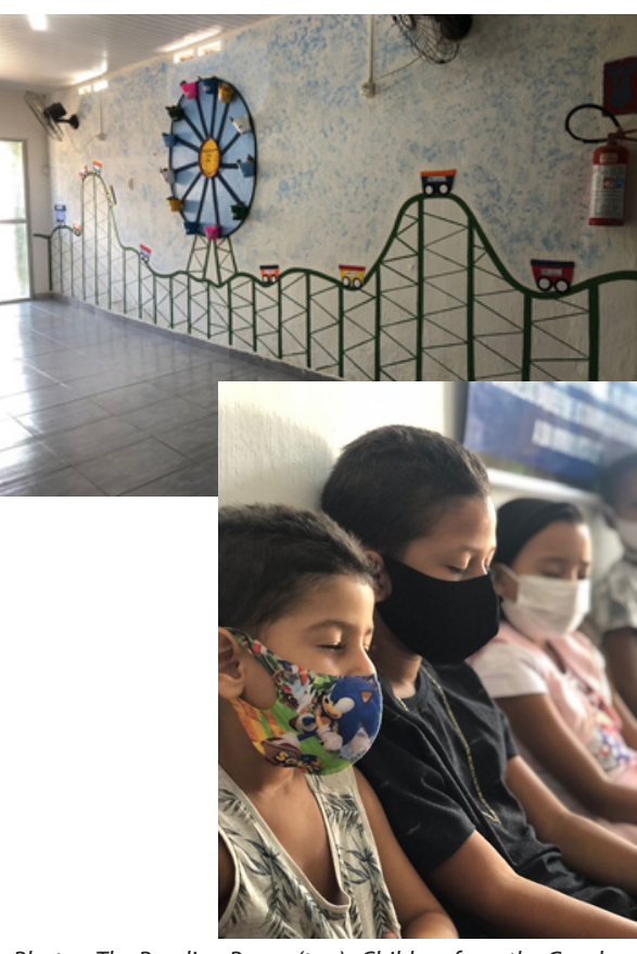
Photos: The Reading Room (top) Children from the Good News Club (bottom)

In February, when the schools restart, we hope to start up the Reading Room activities and to have our Family Day away for the families of the Good News Club.