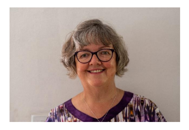
'Yes, my soul, find rest in God: my hope comes from him. Truly he is my rock and my salvation; he is my fortress, I will not be shaken.'