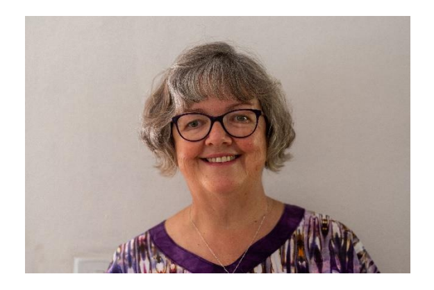
'Give praise to the Lord, proclaim his name; make known among the nations what he has done.' Psalm 105:1

As I write this I am so thankful to the Lord. Last year at this time I was in ICU in the Royal Victoria Hospital. It has been quite a journey. I met with the consultant who is pleased with my progress and I am going to have a medical on 21<sup>st</sup> June which will guide the final decisions and timing of a return to Zambia.