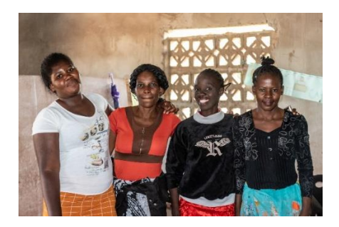
Teachers and cleaner in Mazabuka

Teachers are already back at work in Zambia with many children coming to our ECE classes. During the few weeks off, teachers were making some activities for the children to play with during this term. Teachers also had some reading to do which I hope has inspired them to use their creativity for the benefit of the children in their care. It is amazing that technology these days allows us to do things easily across continents, and even reaches rural areas!