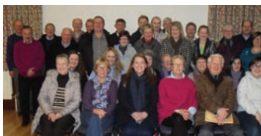
Refresher training at St James's Ballymoney