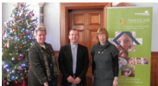
Ballycairn Designated Person, Minister & TC Trainer