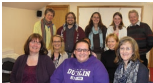
Refresher Training at Arklow