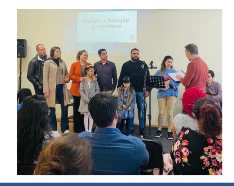
CPV is growing! New members being received in Jan 2023.

In 2023 CPV will be established as a church of the denomination (ICPP) and its first elders will be ordained in the month of February. It is an exciting time in CPV's history and we feel privileged to be a part of it. We also continue with our fortnightly small group ministry, youth work and our family outreach ministry.