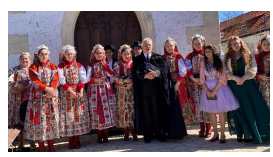
*confirmation at Mera

3. In Late March it was a Joy when six young Roma teens professed faith in Jesus at their confirmation in Mera. All were previous students of ours at the Diakonia and we continue to pray for them as they seek to follow Jesus and faithfully keep the promises they made.