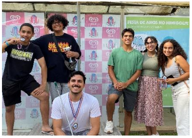
*Young people at CPV

Graúdos & Miúdos is a new monthly ministry directed at young families. We had our second meeting on Saturday 23/09/22. We encourage CPV families to come along and to invite friends who wouldn't normally come to church. Eventually we hope that G&M will become known to and attract families who live near to CPV. Pray for this outreach initiative.