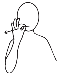
you ask him