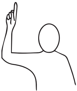
Your Father knows

Teach the children the verse using sign language for the words: Father, things, need and ask. Repeat the verse several times until they know it without looking at the words.