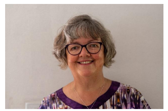
'But as for me, I watch in hope for the Lord, I wait for God my Saviour; my God will hear me.'