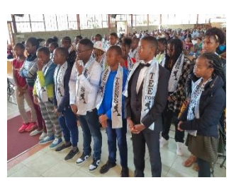
PCEA Githungucu - 55 new recruits